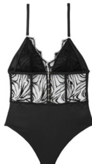
KEEP IT PRIVATE