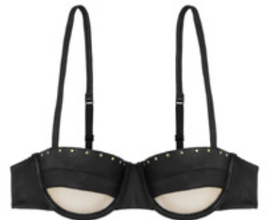
NOTHING TO HIDE