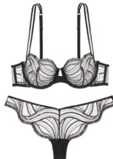
WHISPER OF DESIRE