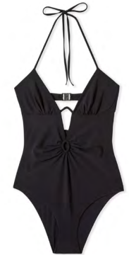
RITA One piece