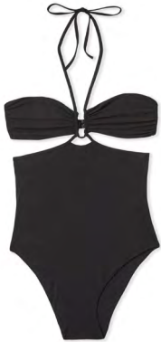
DANA One piece