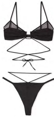
BAYA Swimsuit Set