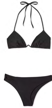
RITA Swimsuit Set