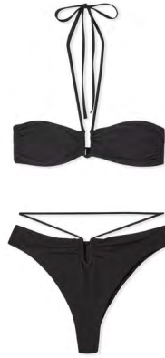
DANA Swimsuit Set