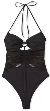
ANIA One piece