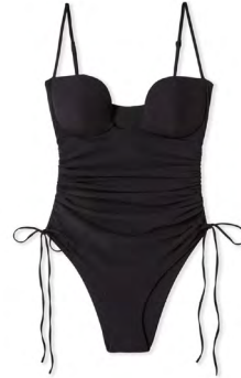
RITA One piece