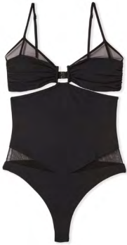
BAYA One piece